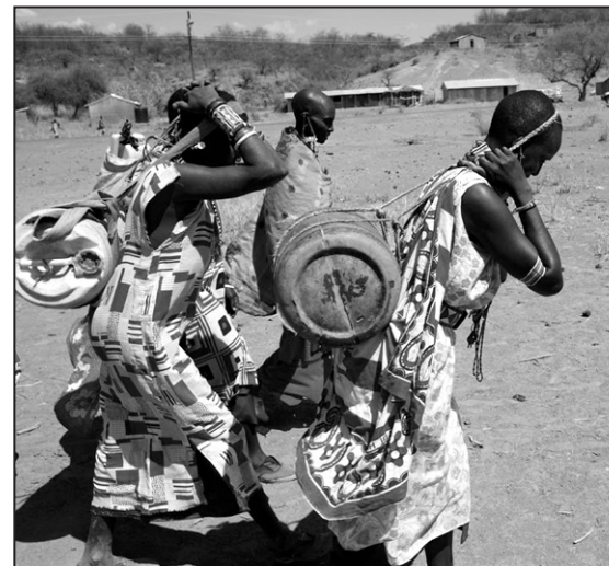
Maasai women carrying water in Kenya.

Indigenous cultures across the Americas, South Pacific and Australia are also in danger. South Pacific islands like Tuvalu, the Solomons