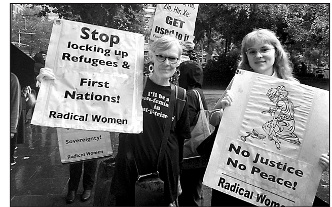
Melbourne Radical Women at 2020 International Women's Day march.

Feminists must bring these inseparable demands into the environmental, refugee and reproductive justice movements. Our united voices as sisters of colour, First Nations, refugees and immigrants, queer and trans folks and unionists can bring these movements together. With this multi-issue strength and leadership, we can triumph over forces that, right now, appear insurmountable.