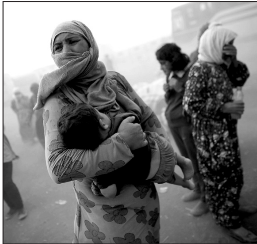
Kurdish-Syrian refugees on the Turkish border.